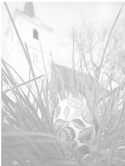
Sixth Sunday of Easter